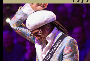
NILE RODGERS & CHIC