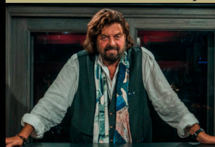
ALAN PARSONS LIVE PROJECT